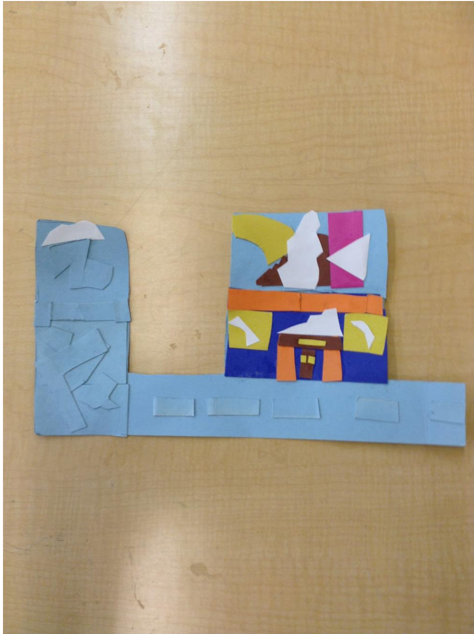
Collagraph of New York Times Square by Kemely